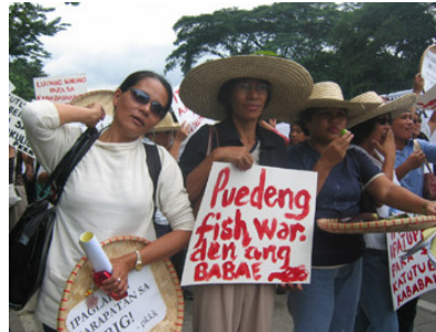
Women Can Also be Fishwardens Members of PKKK

Rural Women and Urban Poor Women joined forces meeting along the streets of Quezon City Memorial Circle last October 17. It is also the day of Solidarity with the Women's Global Charter for Humanity.